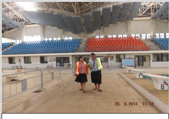
LTD Team siting the Registration Fale

The site visit was also considered an invaluable activity for the division as part of field work capacity building exercises to observe on how the construction works are carried out and managed as well as learning about the environmental and social constraints contributed to the delay of some civil and ground works.