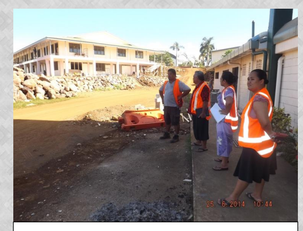
LTD Team on Site with Lucky Construction Team Leader

As the construction and preparation works for the Small Island Developing States slowly coming to an end, the LTD paid a visit to the venue to ground proof all civil construction works covering roads, drainage and rock walls.