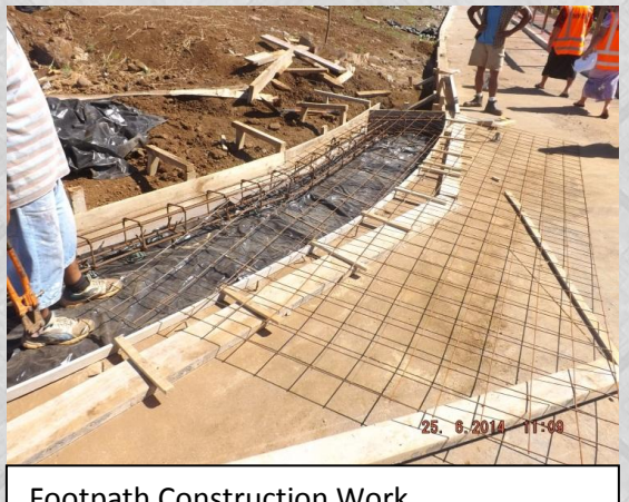
Footpath Construction Work