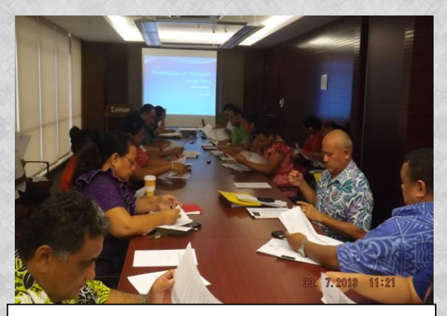
One of the TSSC meetings to discuss the Transport Sector Plan

TSSC comprises of the following members;